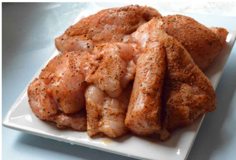
Pictured Above: Cajun chicken marinating before being skewered